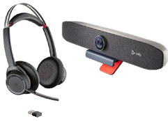
VOYAGER FOCUS UC/ POLY STUDIO P15