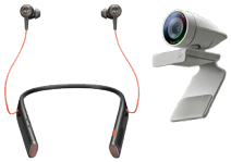
VOYAGER 6200 UC/ POLY STUDIO P5