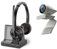
SAVI 8200 OFFICE AND UC SERIES/ POLY STUDIO P5